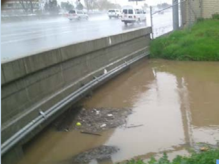
Belmont Creek at Hwy 101 – Feb 2016