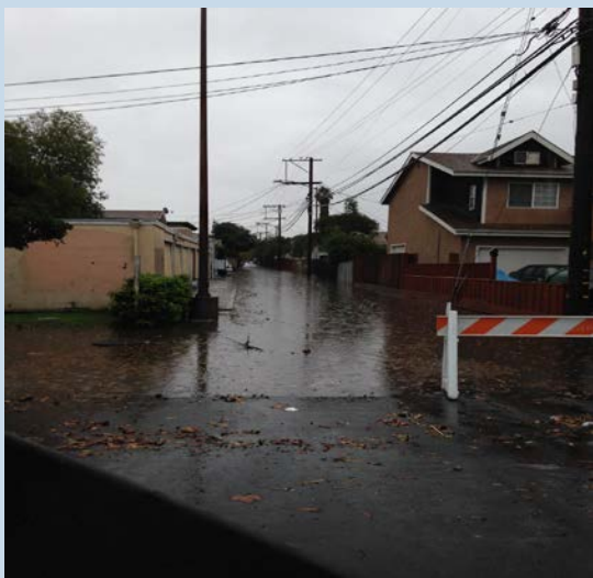
Bay Road, Redwood City December 2014