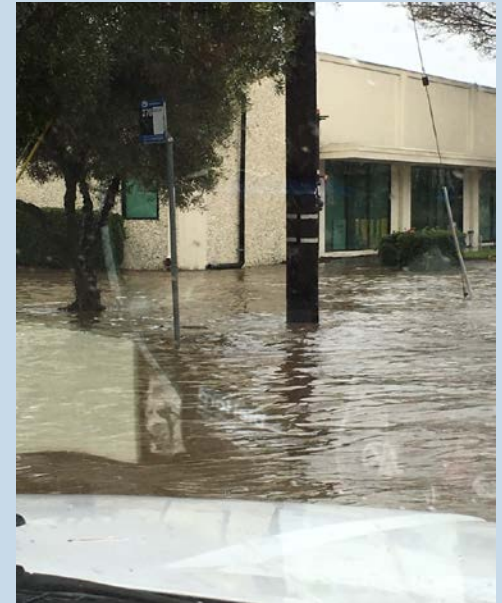
Atherton Channel at Haven Avenue and Marsh Road in Menlo Park February 7, 2017