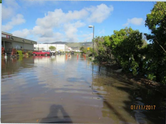
Colma Creek (King tide)