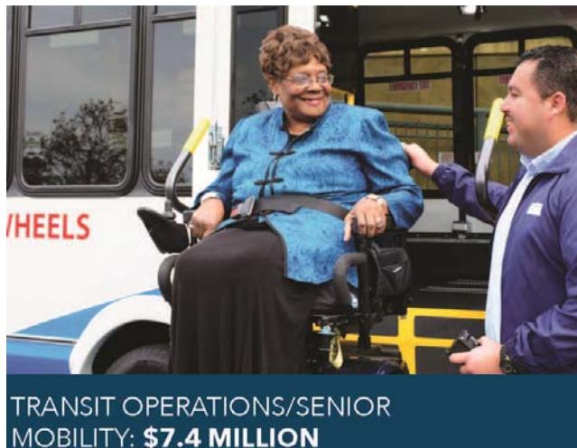
REDIWHEELS Program Performance