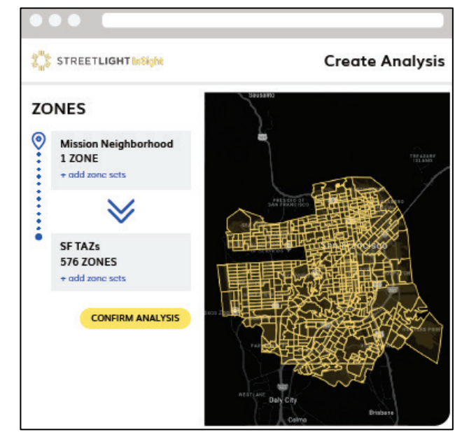
Figure 1: Analytics for every road, bike lane, Census Block, and more at your fingertips.

Access to the StreetLight InSight web-based platform for granular analysis into any of the study areas is available immediately - there will be no delay for C/CAG users to start running nuanced analyses relevant to their planning efforts. StreetLight InSight analytics are purpose-built for transportation and mobility planning and designed to facilitate project performance measurement. Analytics are downloadable as CSV files, so it is easy to use them with other modeling and analysis tools and combine them with existing data resources.