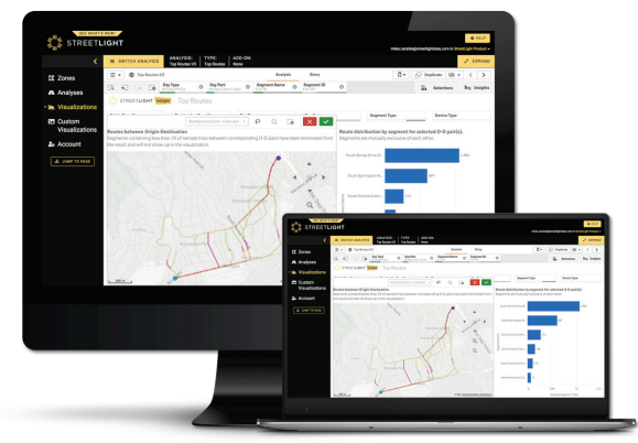
Figure 2: StreetLight InSight® is the only interactive transportation data platform

StreetLight's Software-as-a-Service (SaaS) subscription model allows organizations to run an unlimited number of analyses within their geography without incremental costs, making it affordable to collect data regularly and to study behavior changes over time.