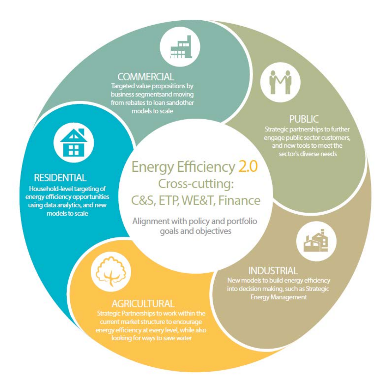
Figure 1.2 - PG&E's EE Revised Portfolio Focus Areas.

As PG&E transitions to a fully 3P Implementer supported EE portfolio that includes 3P EE Programs and Local Government Partnership (LGP) Programs, PG&E's role will evolve to that of a Portfolio Administrator (PA), and the role of 3P Implementers implementing LGP Programs will also evolve beyond the scope observed today. Figure 1.3 – 3P Implementer Roles in EE Programs that include LGP Programs provides a simple depiction of these changing roles for both PG&E and 3P EE Implementers.