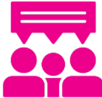
Public Information and Outreach Group