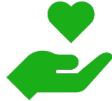
Equity Recovery Group