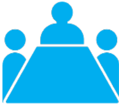
Recovery Coordination Council