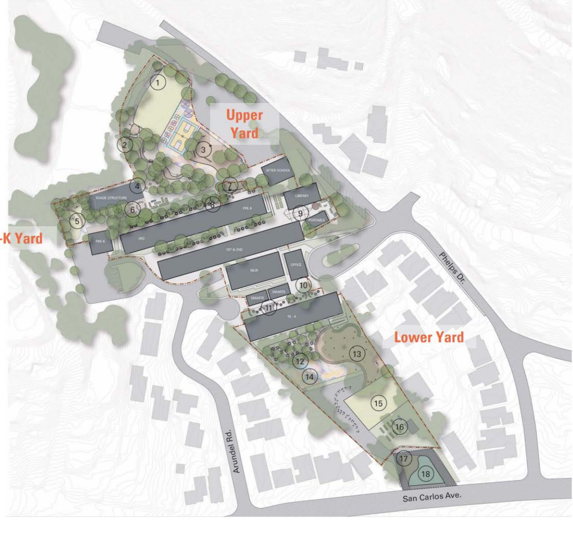
(Arundel Elementary, San Carlos)