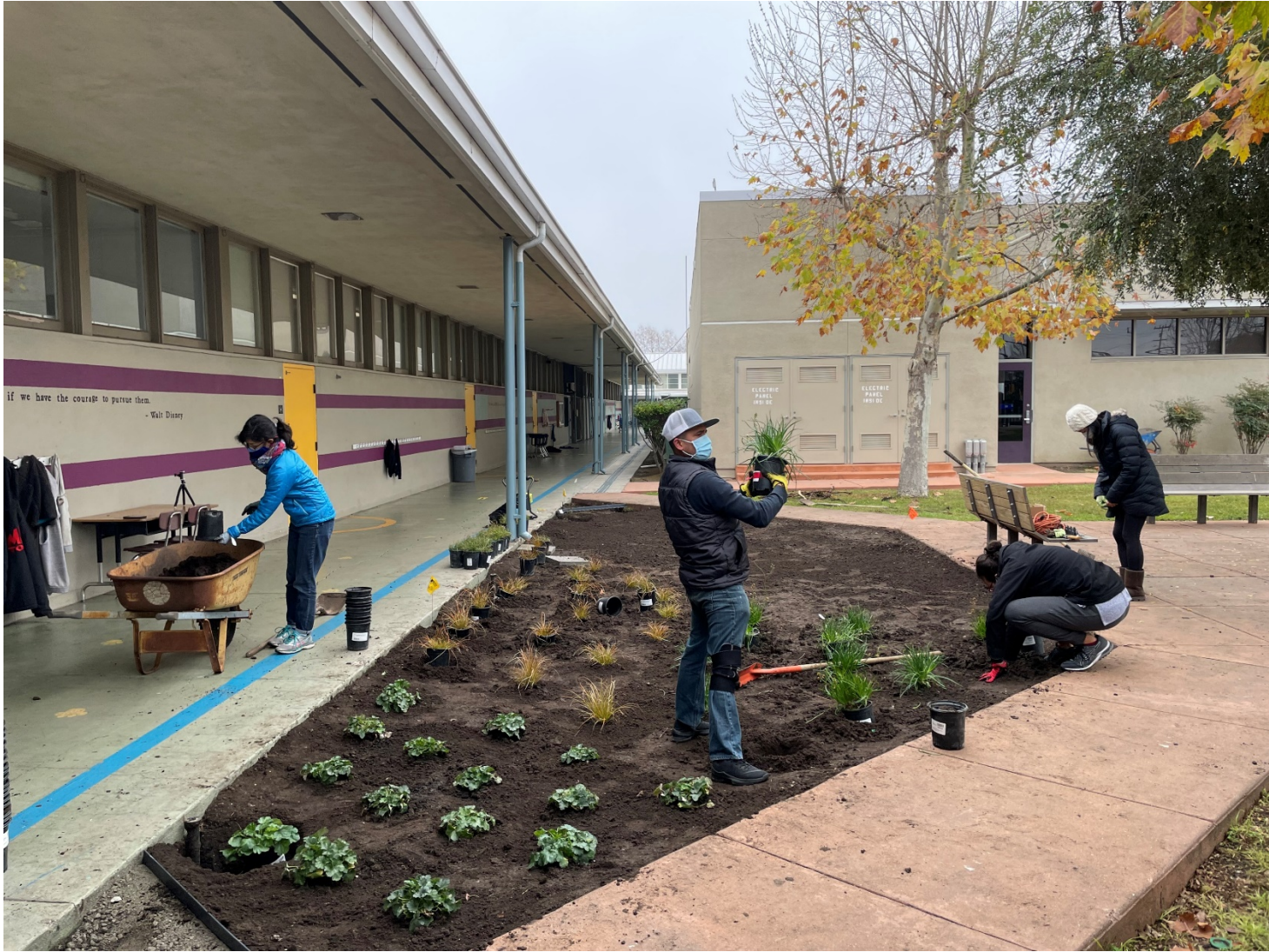
(Belle Haven Elementary School, Menlo Park)