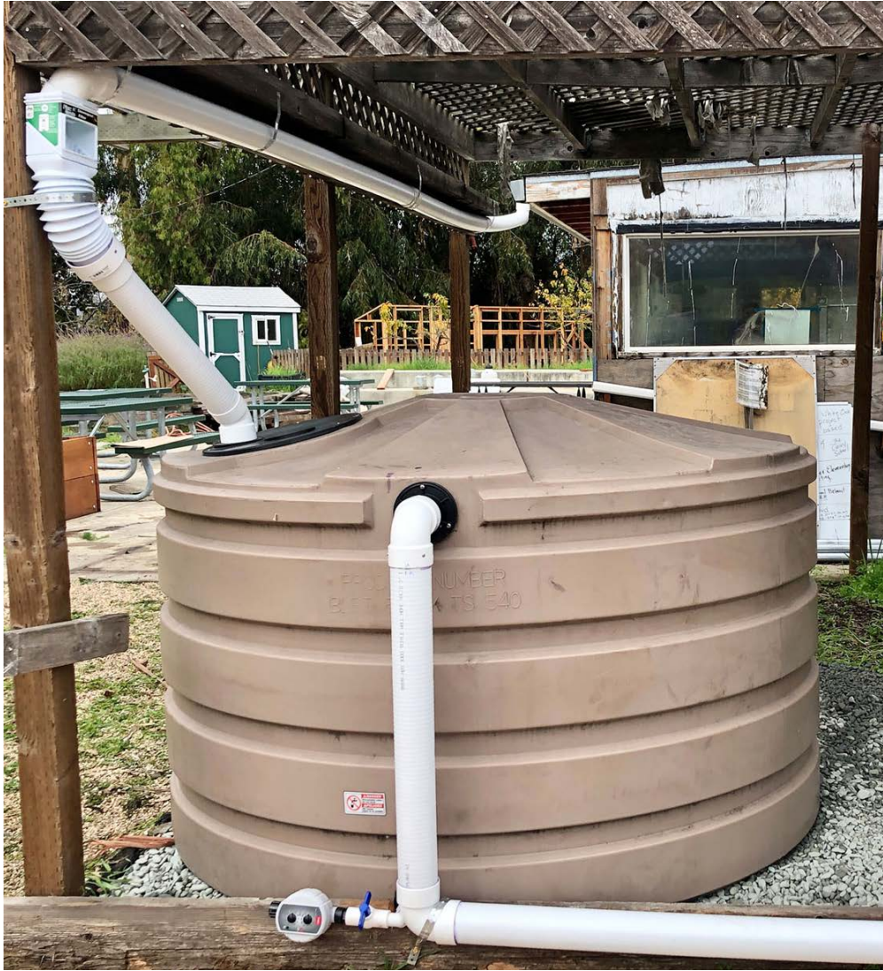
(Redwood High School, Redwood City)