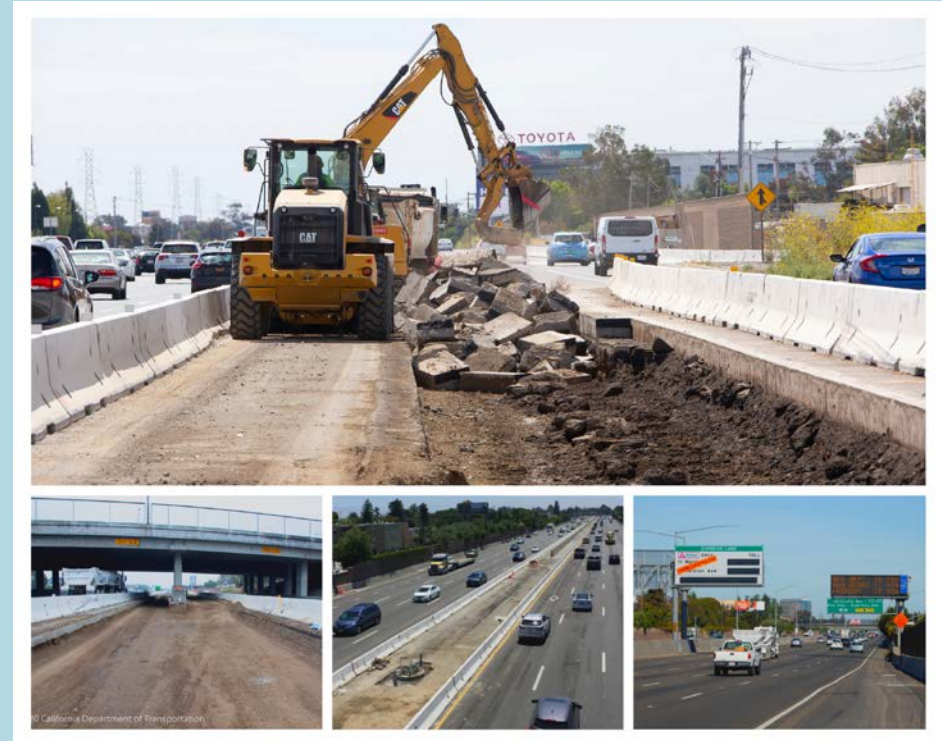
Image Source: Top: https://sustainableinfrastructure.org/wp-content/uploads/2021/07/Simple-Look-of-the-Day-Photo-Collage.png

CTC has the ability to move existing projects out depending on the capacity of the STIP in specific years.