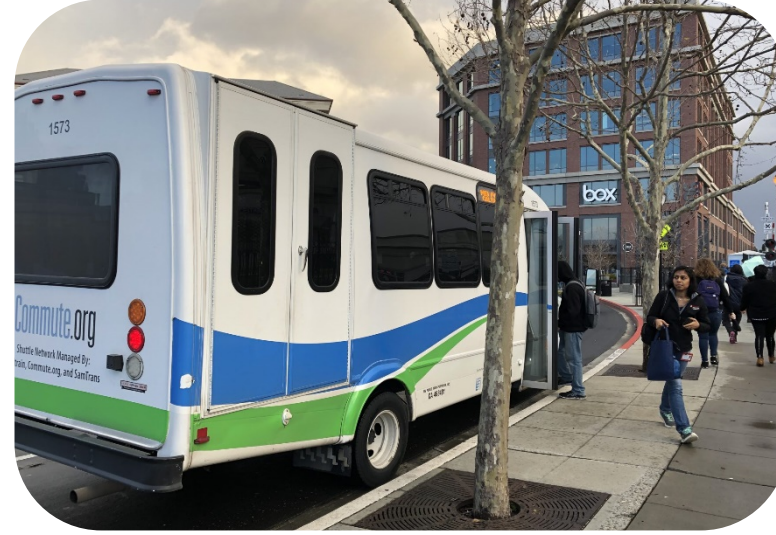
2. Ridesharing/First-Last Mile Connections