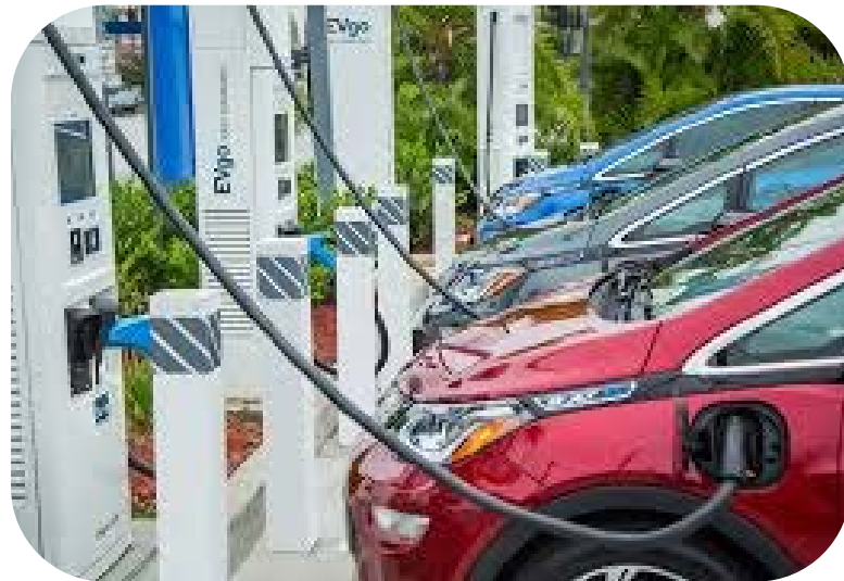
1. Clean air vehicles and electric and hydrogen recharging stations