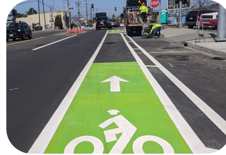
3. Bicycle Facilities