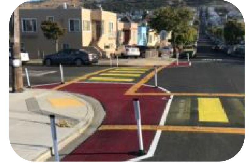
4. Infrastructure Improvement for Trip Reduction