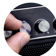
If applicable: Variances, Temporary Provisions & Bonuses