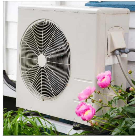
Heat Pump Space Heating & Cooling