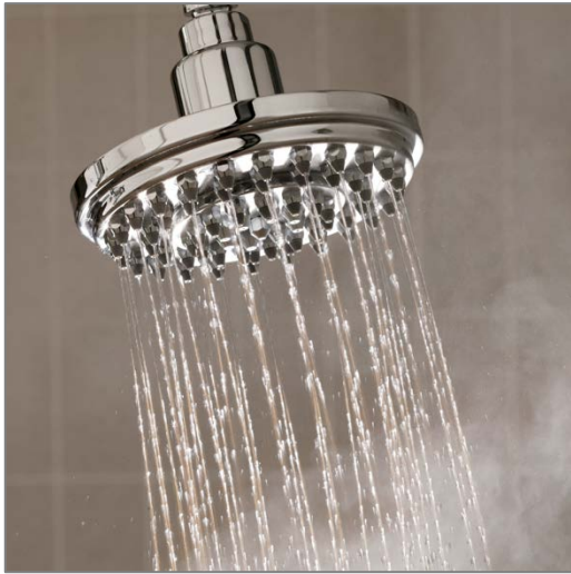
Heat Pump Water Heater