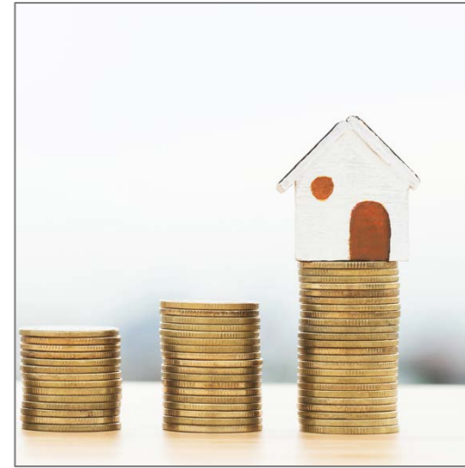
Zero Percent Loan